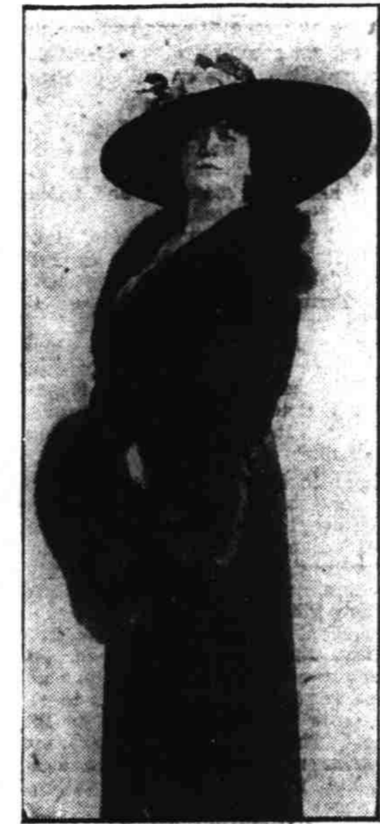
COUNTESS ELEANORA DE CISNEROS Who will sing here.

Probably one of the greatest assets Madame Eleanora de Cisneros has as an operatic singer is her dramatic personality. There are singers and singers whose voices have been the marvels of the age, but they have lacked physical beauty, which materially affected their success. One unconsciously associates with the stage the idea that every professional, whether actress or singer, is possessed of great beauty, and when a con-