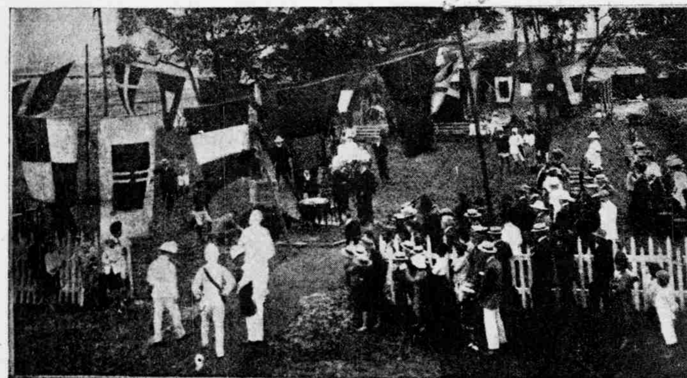
A CARNEGIE LIBRARY FOR THE FIJI ISLANDS—LAYING THE CORNERSTONE OF MR. CARNEGIE'S LATEST GIFT.