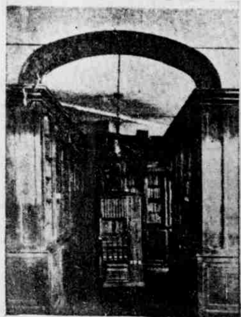
MR. CARNEGIE'S FIRST LIBRARY