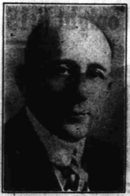
Honolulu demands a fair business administration. That's the kind of administration Honolulu will have when I am mayor.