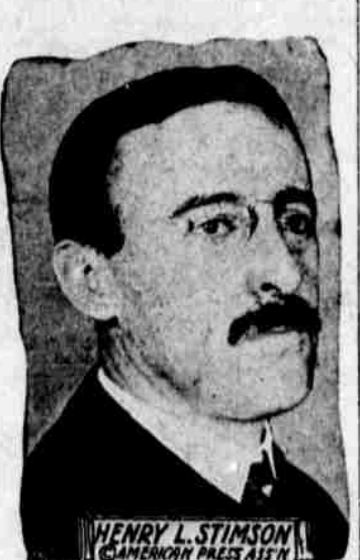
HENRY L. STIMSON

Republican candidate for New York Governor, who was beaten by John A. Dix, Democrat.