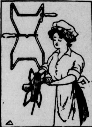
WINDS ROPE NEATLY.

Clothesline Reel. A West Virginia man has devised a reel, herewith shown, on which the clothesline can be gathered quickly and neatly, and she who presides over the family wash will no longer have to loop the rope over thumb and elbow. The reel is in the form of a huge spool or iron framework, with a handle in