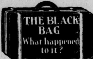
THE BLACK BAG What happened to it?

About Ivory Handled Knives. To restore the color to ivory handled knives after they have become yellow rub them with fine emery or sandpaper. This will restore their whiteness and will remove the stains.