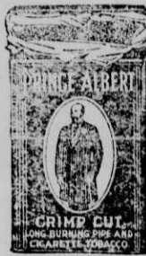
Copyright 1921 By K. J. Reynolds Tobacco Co. Winston-Salem, N. C.