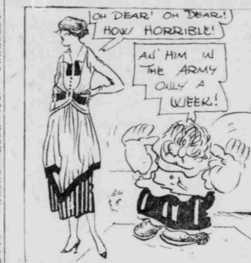
Copyright, 1918, by Newspaper Feature Service, Inc. Great Britain Rights Reserved Registered in U. S. Patent Office