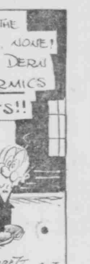
Copyright, 1918, by Newspaper Feature Service, Inc. Great Britain Rights Reserved Registered in U. S. Patent Office