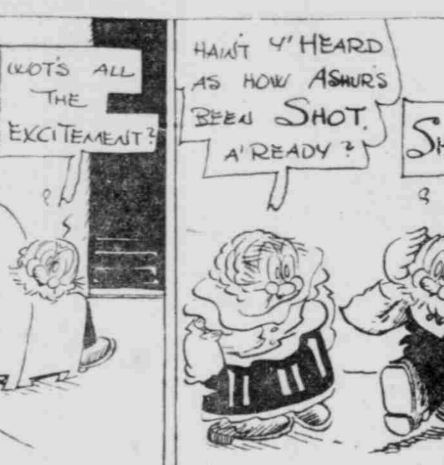
Copyright, 1918, by Newspaper Feature Service, Inc. Great Britain Rights Reserved Registered in U. S. Patent Office