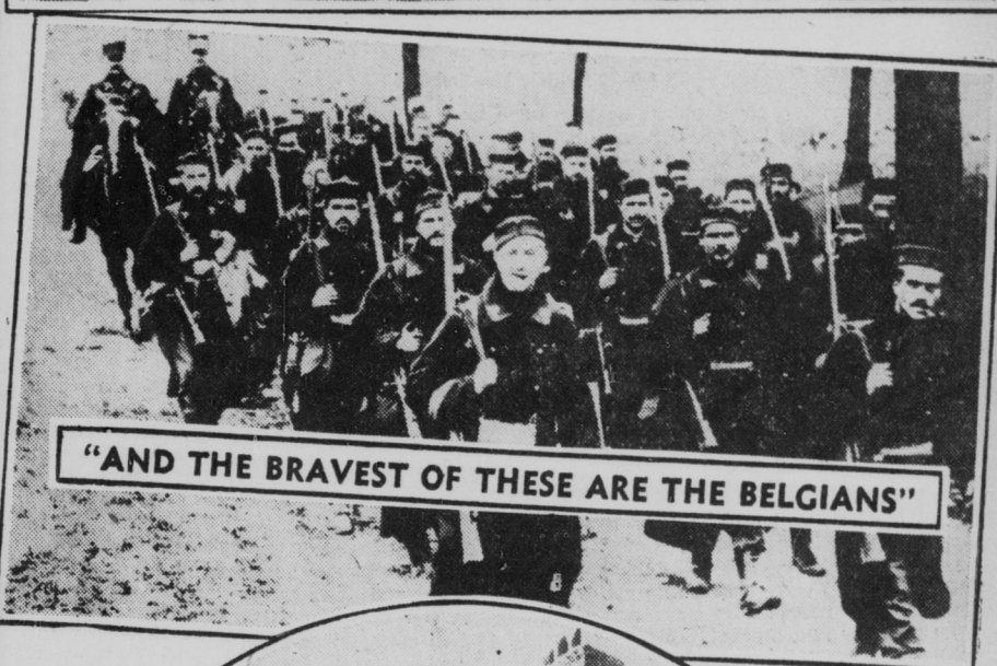
"AND THE BRAVEST OF THESE ARE THE BELGIANS"