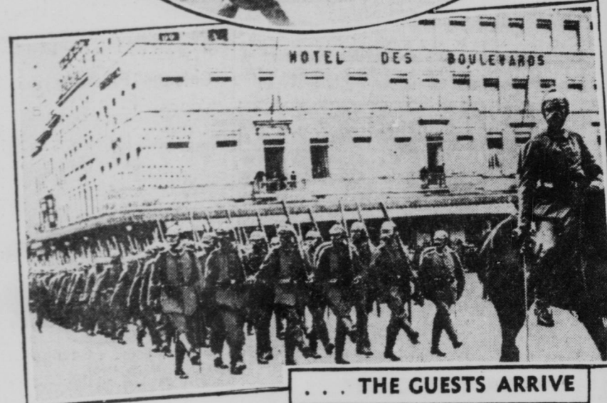
... THE GUESTS ARRIVE