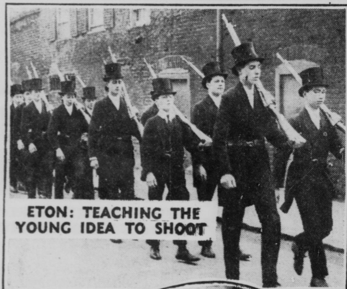
ETON: TEACHING THE YOUNG IDEA TO SHOOT