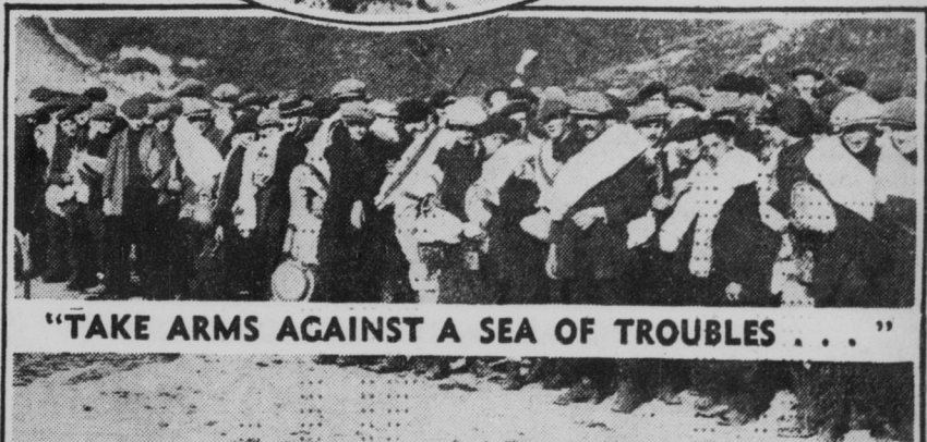
"TAKE ARMS AGAINST A SEA OF TROUBLES . . ."