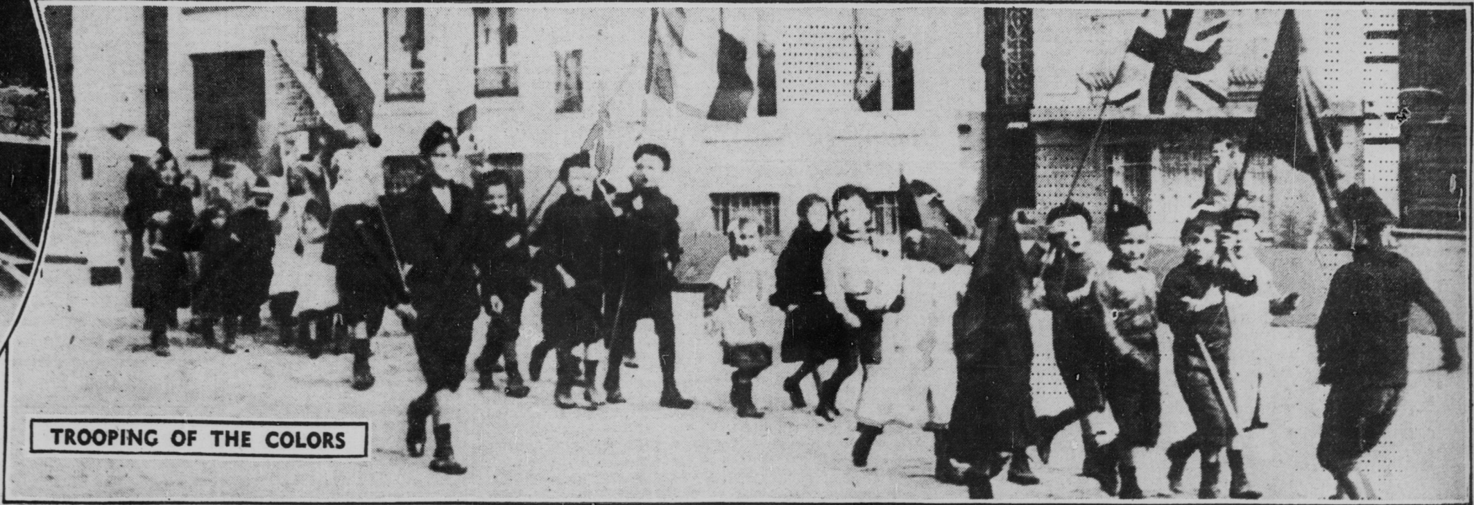
TROOPING OF THE COLORS

THIS IS THE THIRD PAGE OF AUTHENTIC WORLD WAR PICTURES WHICH WILL BE REPUBLISHED IN THE INDIANAPOLIS TIMES DAILY. THEY ARE FROM LAURENCE STALLING'S FAMOUS COLLECTION, "THE FIRST WORLD WAR."