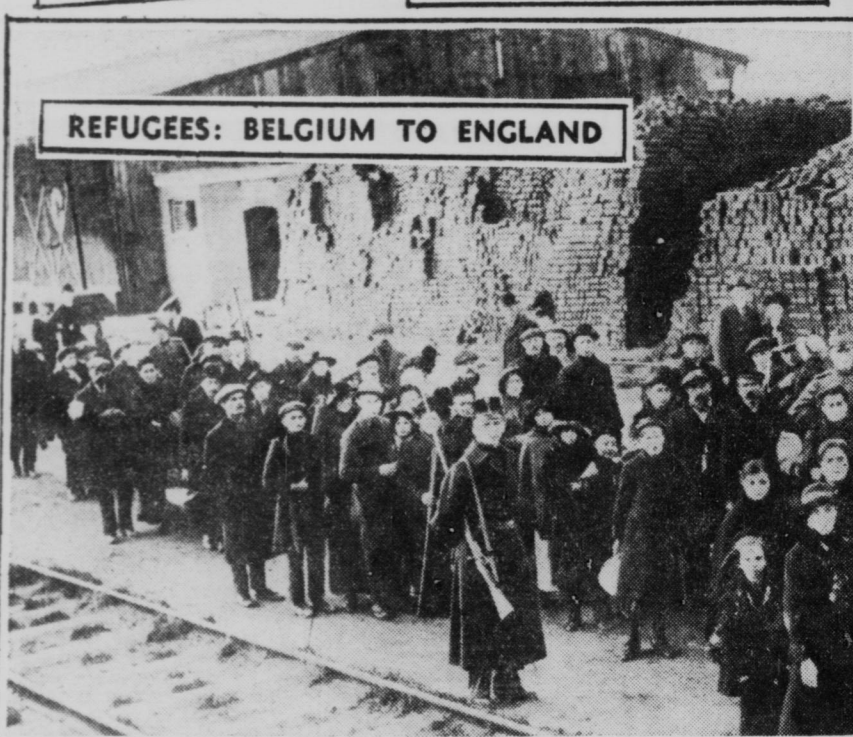
REFUGEES: BELGIUM TO ENGLAND