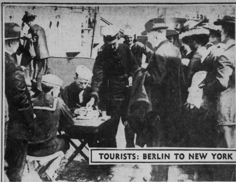
TOURISTS: BERLIN TO NEW YORK