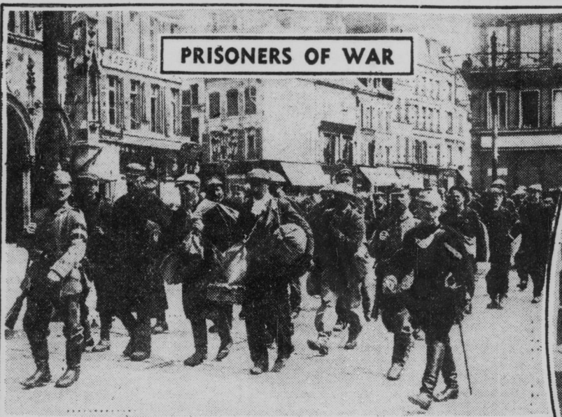
PRISONERS OF WAR