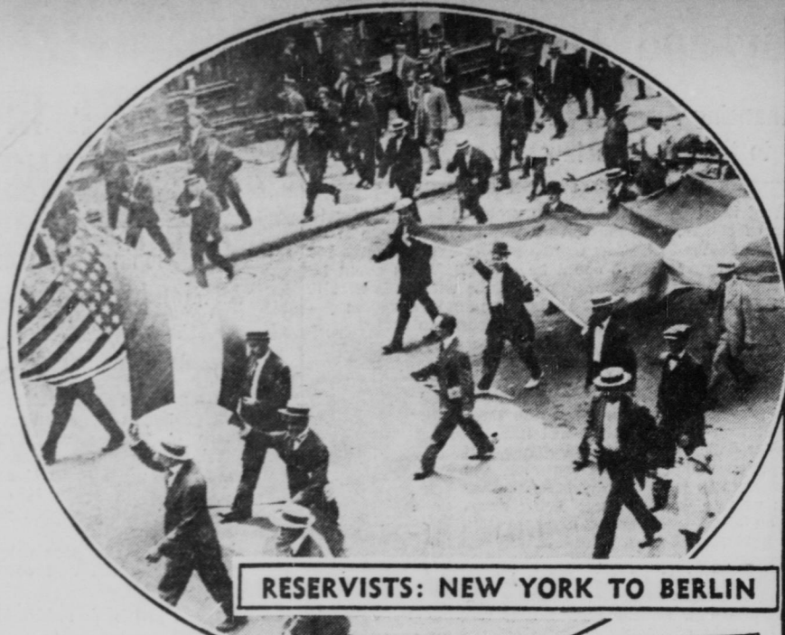
RESERVISTS: NEW YORK TO BERLIN