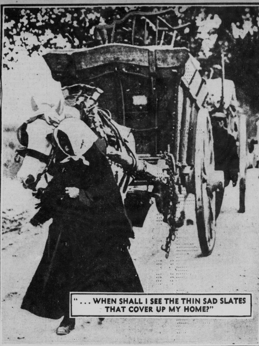
"... WHEN SHALL I SEE THE THIN SAD SLATES THAT COVER UP MY HOME?"