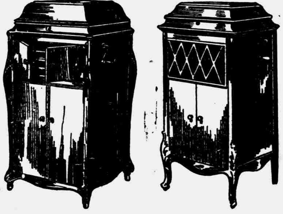
Genuine Victrola $15 to $300.

It is very difficult for any one but an expert to tell the difference between a 50c imitation pearl and a genuine pearl of the same size worth $500—therefore one might buy the 50c imitation because it looks like the genuine article and this is all any pearl has to do.