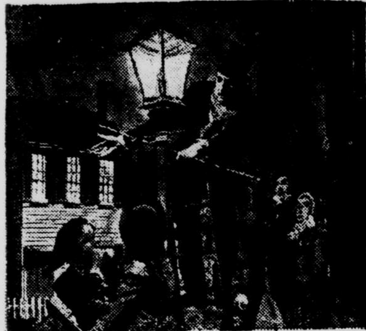
The first home loan by a savings and loan association was made to a lamplighter in Frankford, Pa., in 1891. The home is still standing.

At All 3 Bailey & Himes Stores: 29 MAIN STREET, Downtown Champaign 606 E. GREEN, At Campus 219 N. BROADWAY, In Urbana