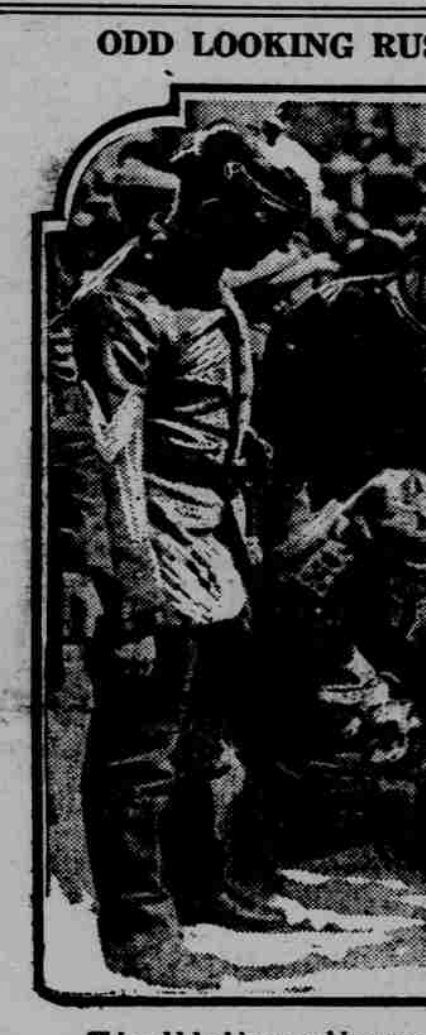
This odd looking machine gun, captured from the Russians, greatly interested the soldiers and people of Topeka on its arrival here. It is unlike anything in the German war equipment. Photo was taken in Berlin.