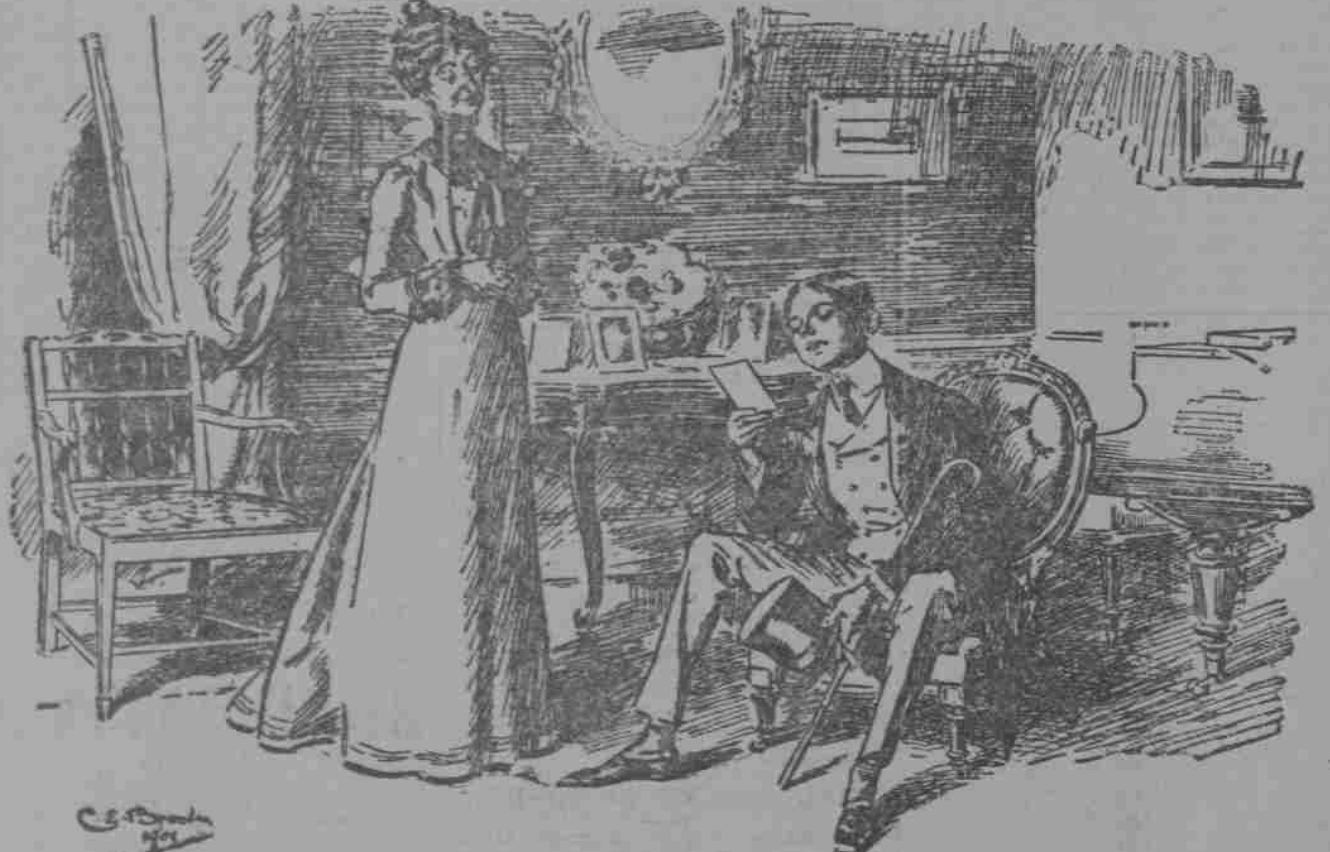
Miss Withers (showing photograph of herself): "I'm afraid it's rather faded." Binks (inexperience, aged 19): "Yes, but it's just like you."

STEPHENS RENOUNCES. Negro Educator Will No Longer Be a Resident of the United States.