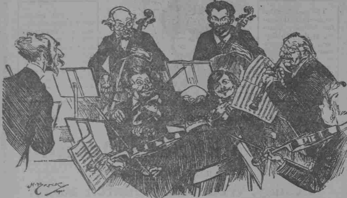
Conductor: "Himmeldonnerwetterelementnocheinmal! Herr Muller, how have you ever such a so bad and miserable blunder made?" Herr Muller: "It was a fly which herself on my music have sat, and I played her."