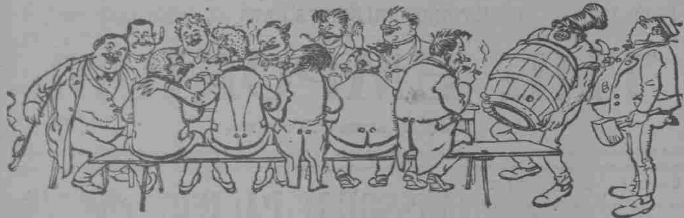
Toastmaster: "Gentlemen, Herr Dinkelspiel has just ordered another keg of beer. Let us, standing, drink to his speedy rise in the world."