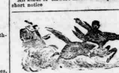
Man's Useful Friend. Will be welcome to every home. Everybody loves such a dog.