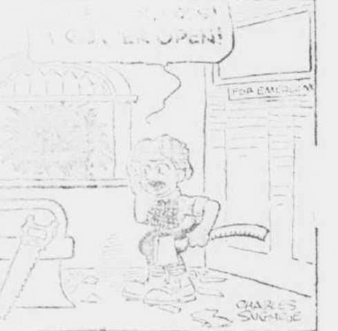
Plate Glass FOR Wind Shields

Coupes and Sedans OUT ALL SIZES AND SHAPES.