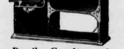
Dangler Gasoline and Blue Flame Oil Stoves

Received the Grand Prize, very Highest Award, and Gold Medal at World's Fair, St. Louis. All that experience could suggest and skill accomplish has been put into these stoves. The result is they look right, work right and stay right. Dangler Stoves are constructed according to the safety requirements of the National Board of Fire Underwriters, and are on their list of permitted stoves. For sale by