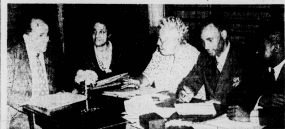
Setting a 1942 goal of 10,000 members in a huge membership drive the National Association for the Advancement of Colored People climaxed their drive by getting 10,236 members and $11,807.75. Over 700 workers took part in the "Victory" night celebration. Shown here are the division leaders.