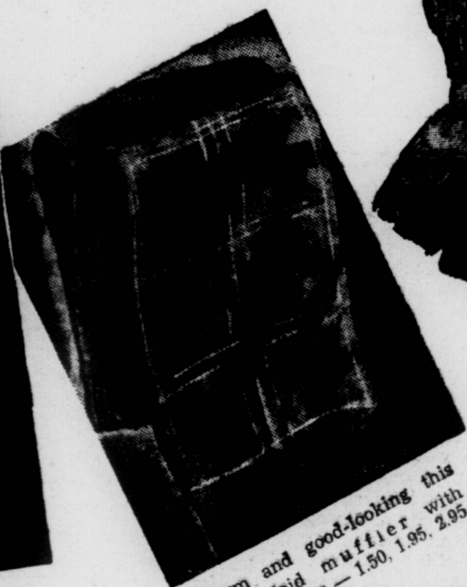
Warm and good-looking this wool plaid muffler with fringed edges — 1.50, 1.95, 2.95, to 3.95.