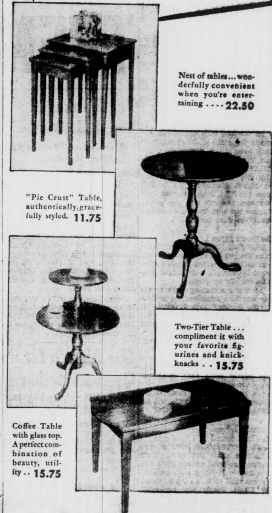
Nest of tables... wonderfully convenient when you're entertaining... 22.50