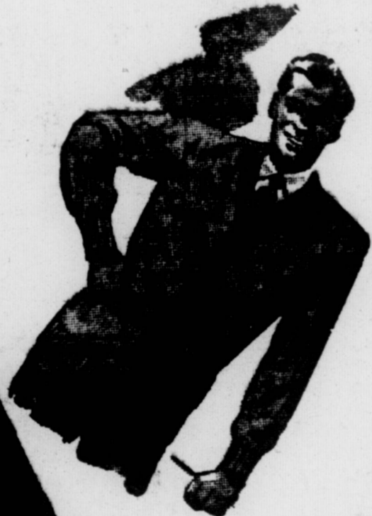
Good looking and warm too this 100% all wool coat sweater. Come in brown, navy, green and tan — 5.00, 6.50, 7.50 to 10.00.