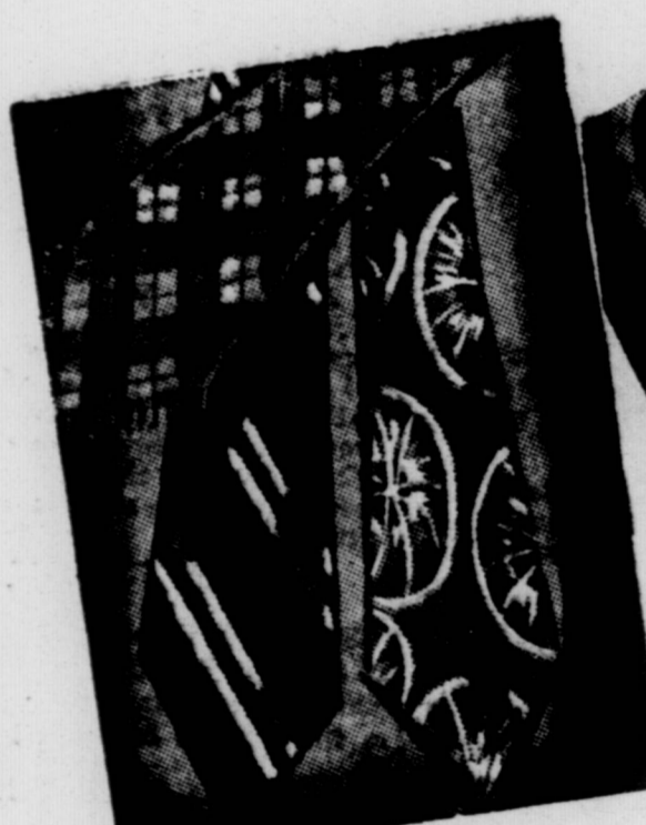
Tie jamboree — conservative patterns and solids in wools and rayons — 1.00, 1.50 to 2.50.