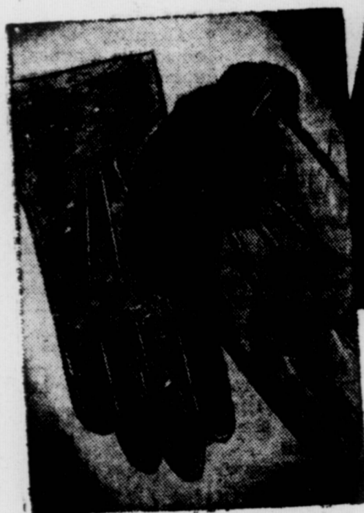
Gloved in warmth and smartness. Genuine pigskins. Fleece lined. 2.95 to 6.00

Draft defense for stay-at-home evenings. Flannel robe — comfortable, warm and good looking. In all colors. — 7.50, 10.00, 13.50, 20.00.