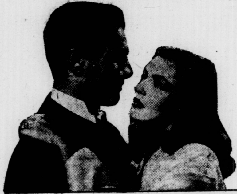
Ella Raines in "Enter Arsene Lupin" will be shown with Gary Cooper, Marlene Dietrich in "Desire" at the Wyandotte theatre, Tuesday through Thursday.