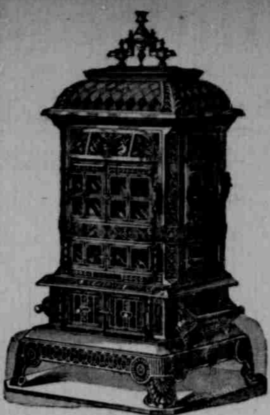
It has the Round Fire Pot, Four Flues, and Anti-Clinker Grate. This is the best heater on the globe.

Van der Veen & Witman 106 MONROE STREET.