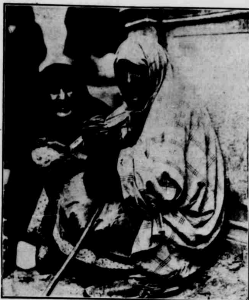
T HIS picture, with the one preceding, might be entitled, "From Queen to Peasant Woman." The old refugee who squats against the wall waiting her turn at the Red Cross station has at least one comfort left—her cigarette. Most of the peasant women "roll their own." It is genteel as a cup of tea.