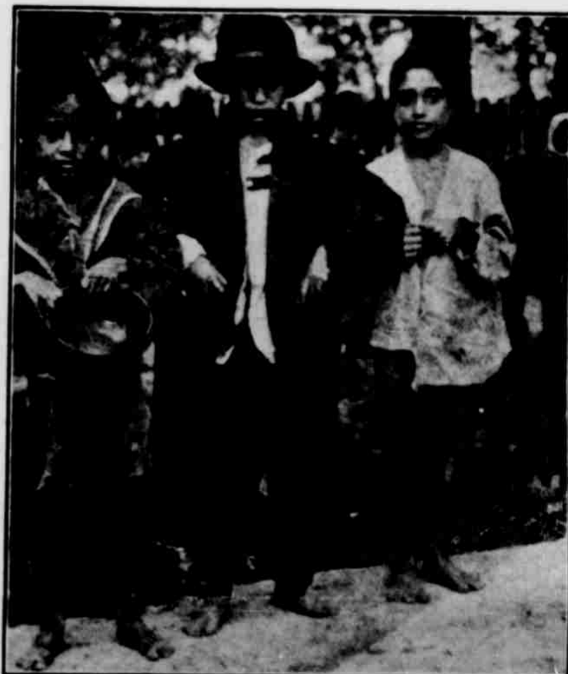
T HERE is no doubt about the undernutrition of these youngsters and their need of clothing too. When the Germans and Austrians came, not only did all the food vanish in a night, but every scrap of cloth disappeared too. When relief was sent through to the people, all sorts of odd clothing devices were found. These boys were soon clothed.