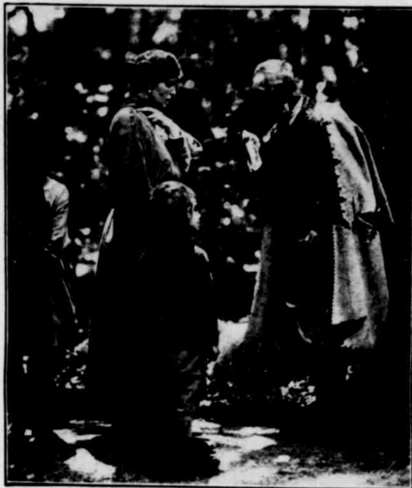
A NATIVE chieftain from the hills weeps as he tells his Queen the story of his people during the war. The Queen herself is touched, and clutches her throat in her emotion. There are cruel tales of the mountains which will never be told, but which will find their immortality in the wild hill threnodies.