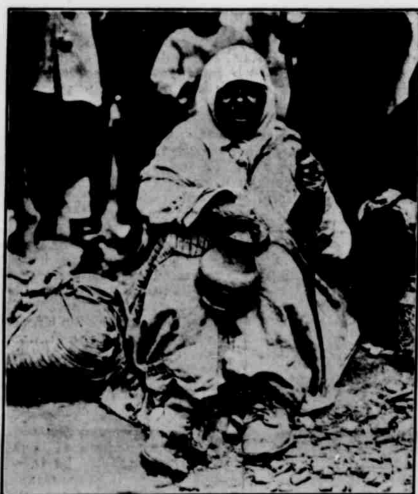
S HE looks as if she were some debris from the African coast flung upon the Balkan highlands, and probably she is: a remnant of some ancient coast raid, or the leavings of a chance ship. She is an object of distinction among a race of fair-skinned people. She has walked for days to reach relief quarters to get a pair of shoes. Observe her old ones.