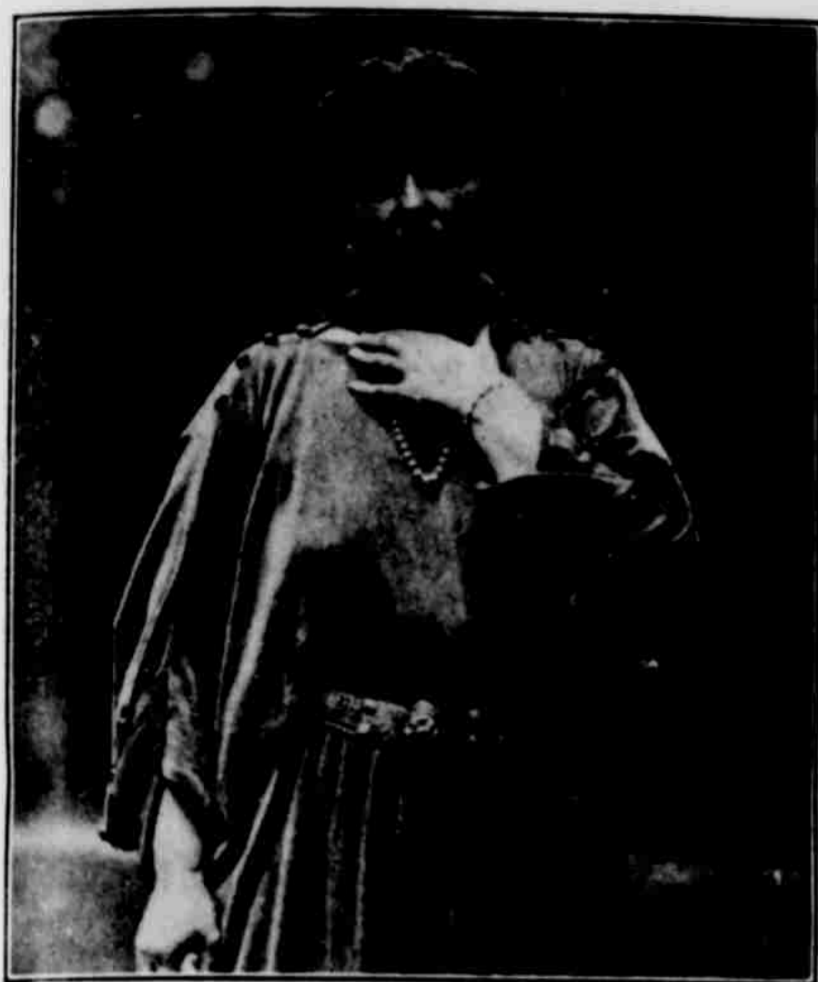
A LADY of sorrows is Marie, Queen of Roumania. Driven from her country by invading armies she was long compelled to stand helpless and view the gradual decline into starvation and death of her people. She is now the chum of many American girls, nurses and helpers, who went to Roumania.