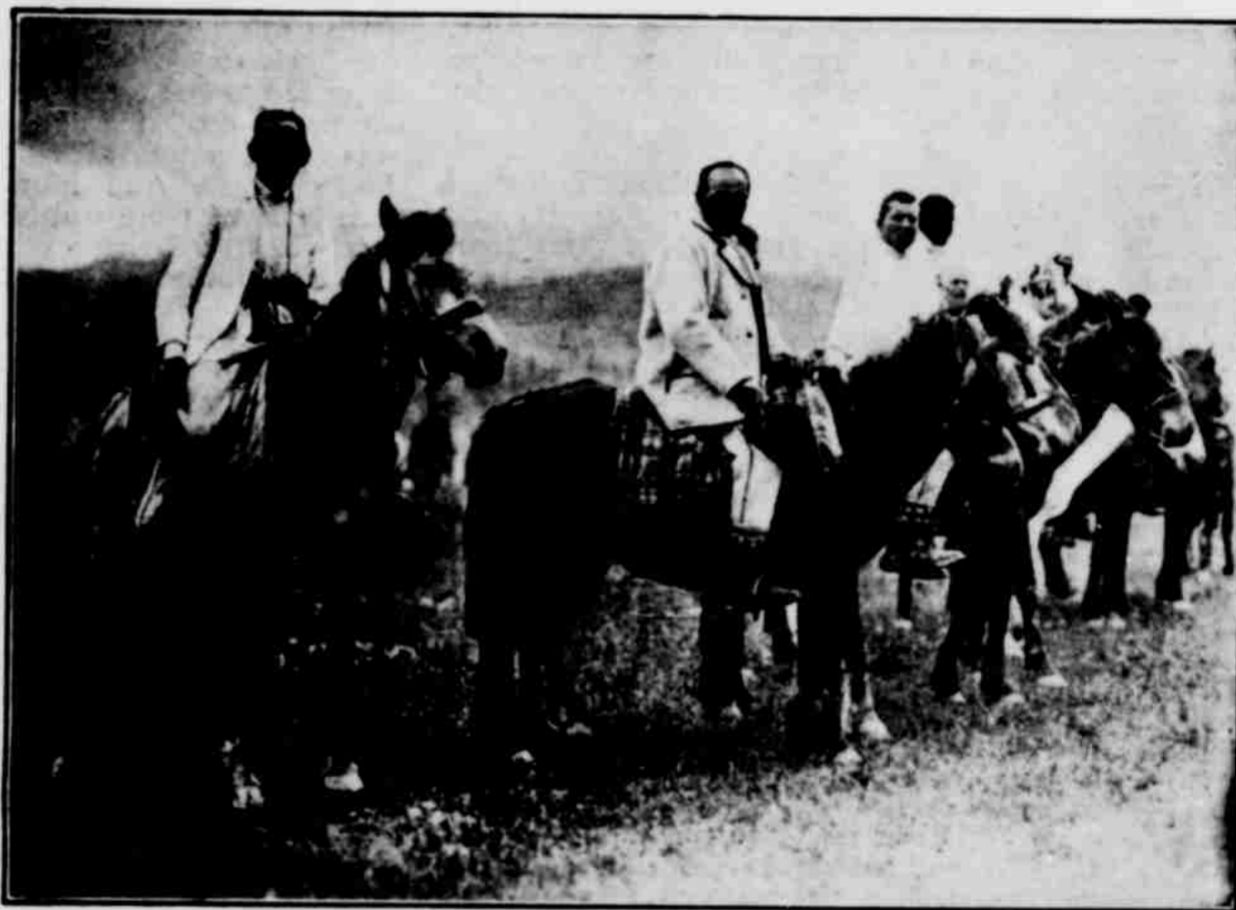
H ERE are Balkan types, the men who live on the borderland between East and West. They are the inheritors of all the ceaseless ebb and flow of war and change across their small, important strip of earth. A great deal of patient leading will be necessary before the sense of fear and the love of strife can be eradicated from the racial psychology. The help they are now receiving from the world is a valuable lesson in the worth of kindness and the finer sentiments.