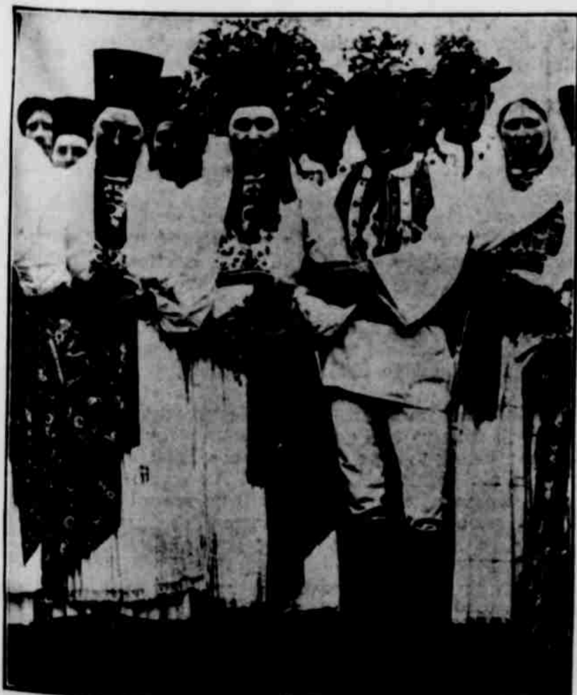
T HIS photograph harks back to happier times, when there were yet clothes in the land and the peoples' faces did not show the pinch of hunger. A Roumanian wedding is about to take place and it is plain that the Roumanian bridegroom plays a more important part in the "scenery" of the ceremony than the American bridegroom does, and why not?