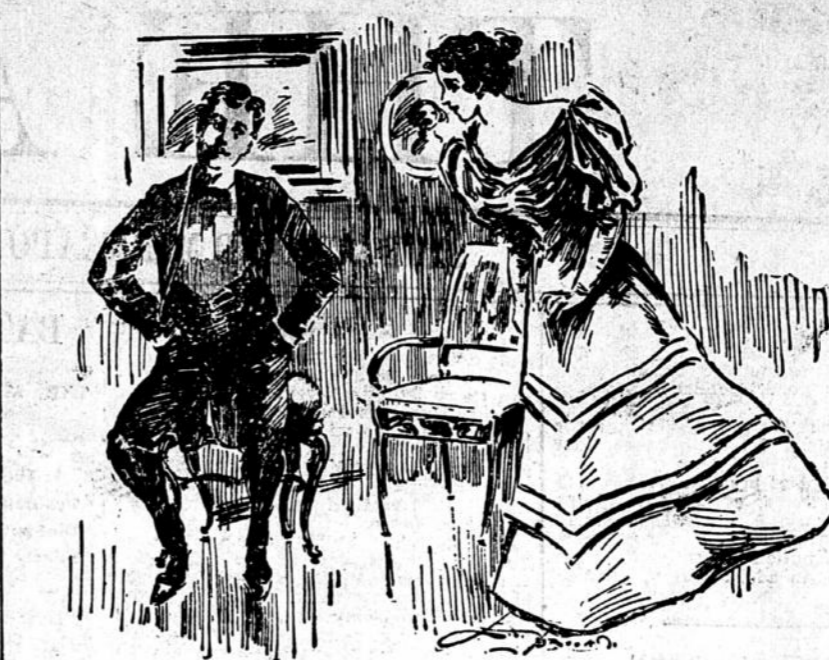
He—You say you know they are to be married soon. She—Why, yes, I heard her tell him to save his money and not give her anything but Christmas.

picture of the serenity and courage with which he drank the fatal hemlock and met death calmly and cheerfully, unmoved even by the entreaties and tears of his friends.