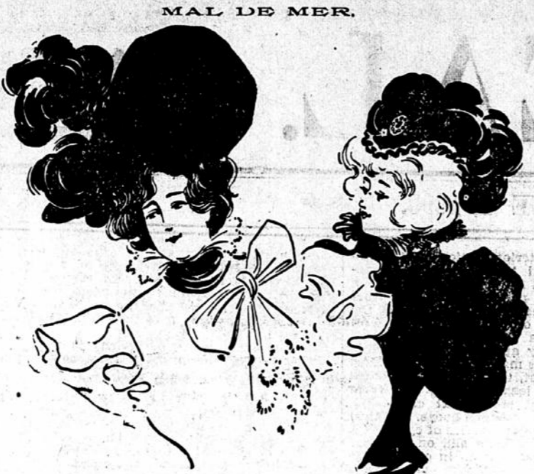
Lille—How true the quotation, "Cast thy bread upon the waters." Lille—Yes, I realized it for the first time when I made the trip across.

NATIONAL AFRO-AMERICAN NEWSPAPER. PUBLISHED WEEKLY BY ADAMS BROS. EDITORS AND PUBLISHERS. 49 E. 4th St. St. Paul, Minn.