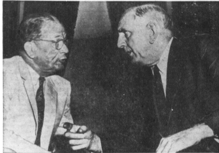
CIVIL RIGHTS FOES —Sen. Richard Russell, D-Ga., (right) and Sen. Allen J. Ellender, D-La., discuss the controversial Civil Rights Bill, and a possible filibuster move, shortly before the bill came up for debate before the Senate. President Eisenhower later met with Russell, leading Southern spokesman, on the measure; and it was reported that the Chief executive was amenable to certain amendments to the bill which would make the South happy.