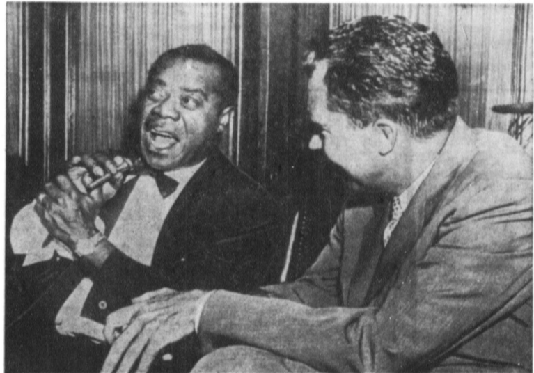
'SATCHMO' SHOWS VEEP HOW —Shortly before leaving for a tour of South America, Russia and Africa as a "goodwill ambassador" of the U. S., jazz star Louis Armstrong demonstrates to Vice President Nixon in Washington the technique he uses to make his horn "cry."