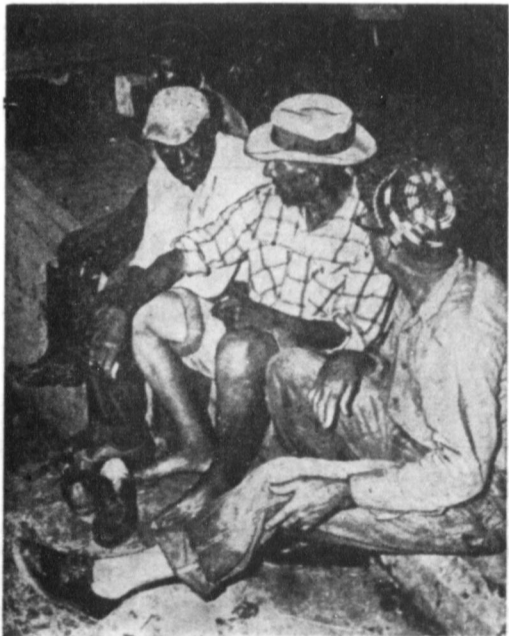
VICTIMS OF AUDREY —Driven from their homes by Hurricane Audrey, these storm victims sit outside the courthouse at Cameron, La., wondering what to do next. Their city felt the full force of Audrey's high winds and tidal waves, which destroyed almost 98 percent of the buildings.

GET WHAT YOU WANT AND SAVE TIME, MONEY AND ENERGY WITH HELPFUL WANT ADS IN THIS PAPER