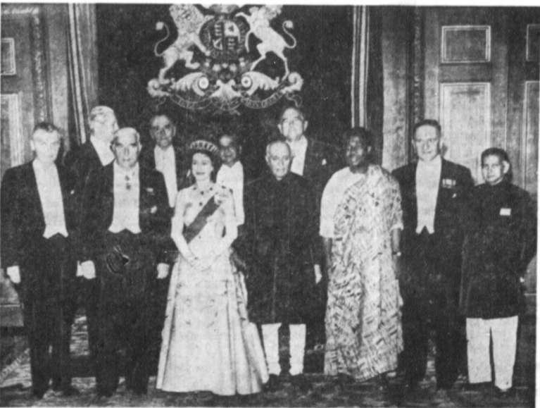
THE QUEENS' MINISTERS —Queen Elizabeth II poses with British Commonwealth ministers at Buckingham Palace, where the ministers were recently dinner guests. Shown front (L. to R.) are: Diefenbaker of Canada, Menzies of Australia, Queen Elizabeth, Nehru of India, Nkrumah of Ghana, Macdonald of New Zealand and Minister of Justice De Silva of Ceylon. Background: McMillan of Great Britain, External Affairs Minister Louw of South Africa; Suhrawardy of Pakistan and Welensky of Rhodesia and Nyasaland.