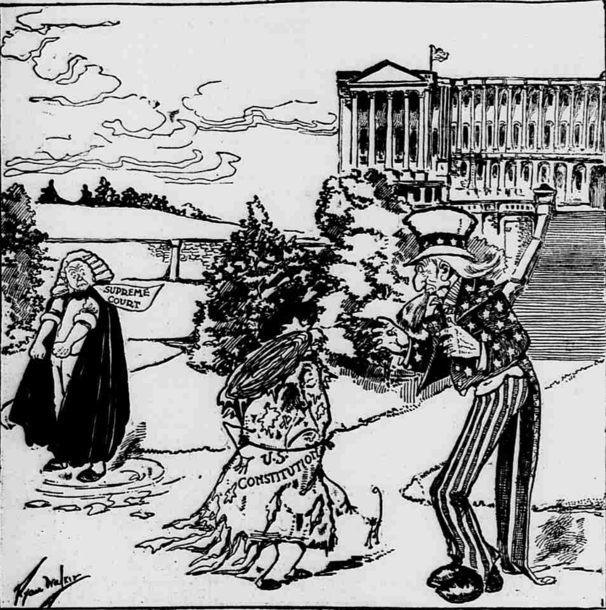
Uncle Sam: "After your fight with that fellow, you look like a bunch of waste paper."

TO THE EDITOR OF THE REPUBLIC. Hot Springs, Ark., May 28.—Whatever difference of opinion may exist on the subject, the decision of the Supreme Court makes it evident that the United States has adopted the colonial policy.