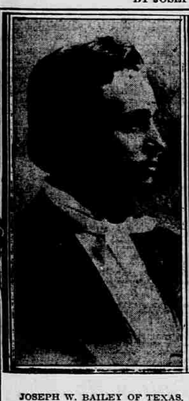
JOSEPH W. BAILEY OF TEXAS.

BAILEY'S POINTED CRITICISMS. "OF ALL THE WEAK ARGUMENTS THAT EVER EMANATED FROM A GREAT COURT, THE ATTEMPT TO SAVE THE FORAKER ACT MUST TAKE FIRST PLACE."