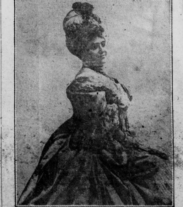
LATEST PORTRAIT OF MME. TETRAZZINI. Mme. Tetrazzini has again captivated London, repeating the triumphs at Covent Garden which marked her appearances there before she came to America. Paris critics refer to the spirit which has greeted her in the English capital as "epileptic enthusiasm." The famous singer is to be a member of the Manhattan Opera company again next season.

Hearst News Service. Indianapolis, Ind., June 6.—A succession of explosions of acetylene gas in the plant of the Prestolite Company this morning tore up the plant, wrecked the walls of the dormitory of the Sisters of St. Vincent's Hospital and damaged several other buildings in the vicinity. Six employees of the plant and a fireman, a member of the fire station located next door, were seriously hurt.