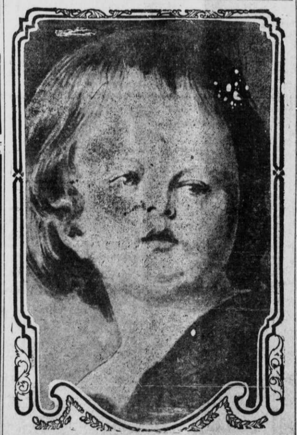
Picture of Van Dyck's missing painting, known as "A Child's Head," the original of which a custom inspector in New York thought he had found in the baggage of a trans-Atlantic passenger.