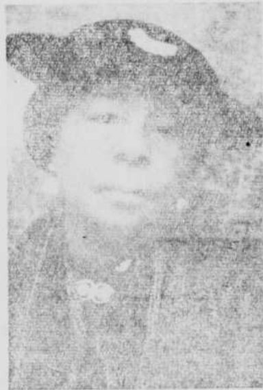
Formerly of Meridian, who is now residing in Indianapolis, Indiana.