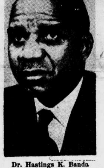
Dr. Hastings K. Banda

London, Aug. 5.—Unpredictable Premier Patrice Lumumba of the Congo is continuing to keep the capitals of the world guessing. Speculation on a possible Ghana-Congo merger has been taken little further by his Aug. 2 midnight (Continued on Page Six)