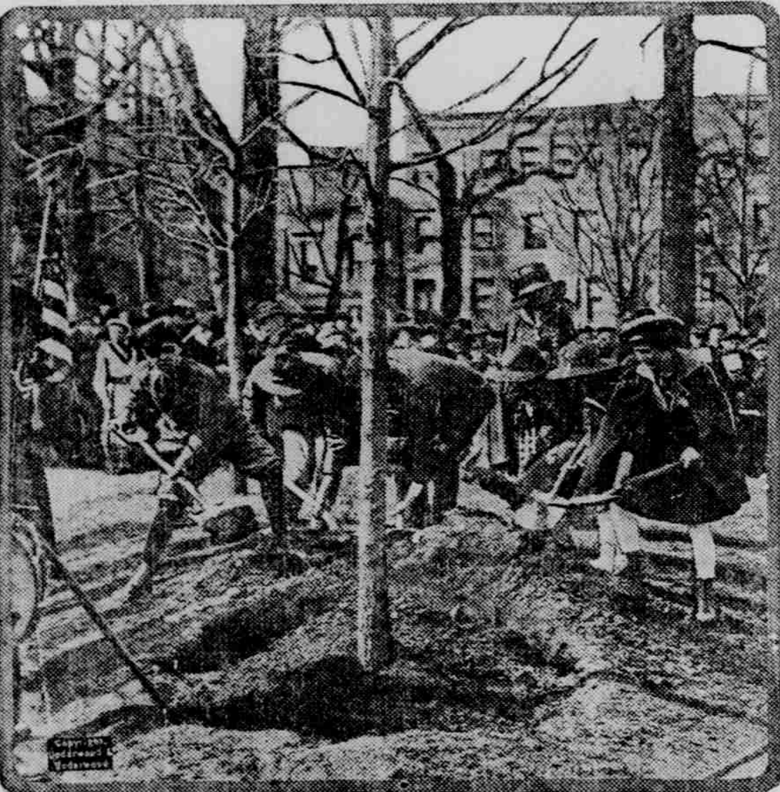
To the borough of Brooklyn fell the honor of planting the first trees to the memory of the late Col. Theodore Roosevelt. The celebration was attended by many of the ex-president's closest friends. The planting was held under the auspices of the Junior League of the American Association for the Planting and the Preservation of City Trees. This photograph shows the trees being set at Bedford park, Brooklyn.