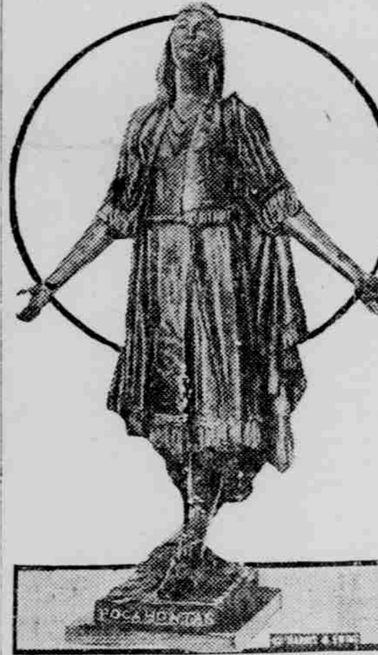
This fine bronze statue of Pocahontas, made by William Ordway Partridge, will be placed on the site selected for it on Jamestown Island just as soon as the Pocahontas Memorial association raises the balance of $1,200 due on its purchase. The statue is now in the Corcoran Gallery of Art in Washington.