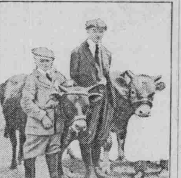
Club Boys With Their Purebred Calves.

I want to say just a few words to the farm boys and girls, and the older people need not bother to read it at all. Now, you and I know that the boys' and girls' club work represents one of the most important lines of agricultural activity in the United States today. I believe it is important, because it has such large possibilities. We men and women who are trying to improve farming and farm life will be out of the game when you boys and girls are just reaching the prime of life. You have the advantage of us because you are learning the principles of good agriculture and home-making while you are still young enough to learn to the best advantage.