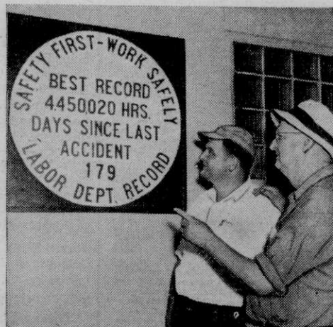
STANDARD EMPLOYEES are actually many times safer on the job than away from it, according to nation-wide statistical studies of accidents. Our accident prevention program helps make Standard a good place to work.