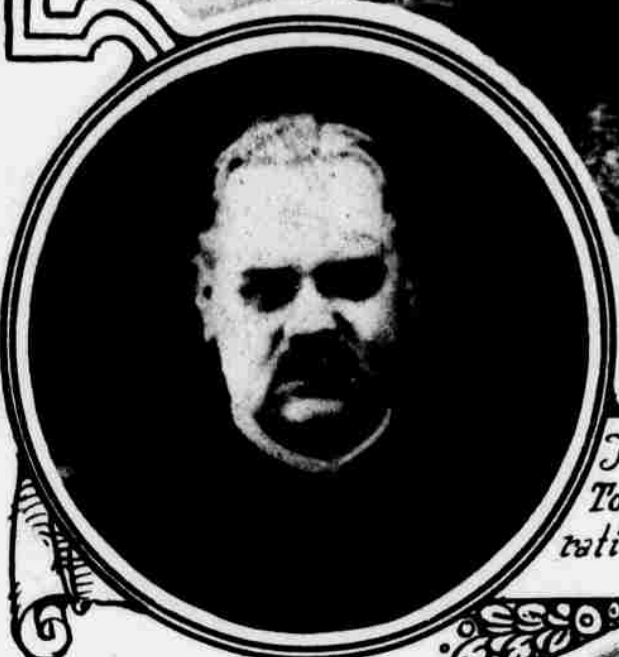
President Todd of the Todd Construction Corporation, builders of the "Omaha"