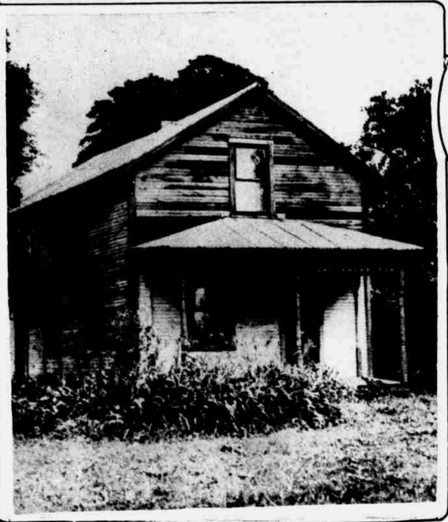
THE LITTLE WOODEN HOME IN CORSICA, OHIO, where Warren G. Harding, President-Elect of the United States, lived during his boyhood days.