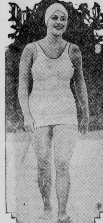
"My, how that girl has grown!" is the ejaculation that springs to our lips when introduced to Aileen Riggin, whom we remember as a great little girl who won the fancy diving championship of the 1920 Olympic games. She is now Mrs. Guy Young, of New York and California, and is shown at White Sulphur Springs, W. Va., where she is vacationing. Aileen has been married for two months.