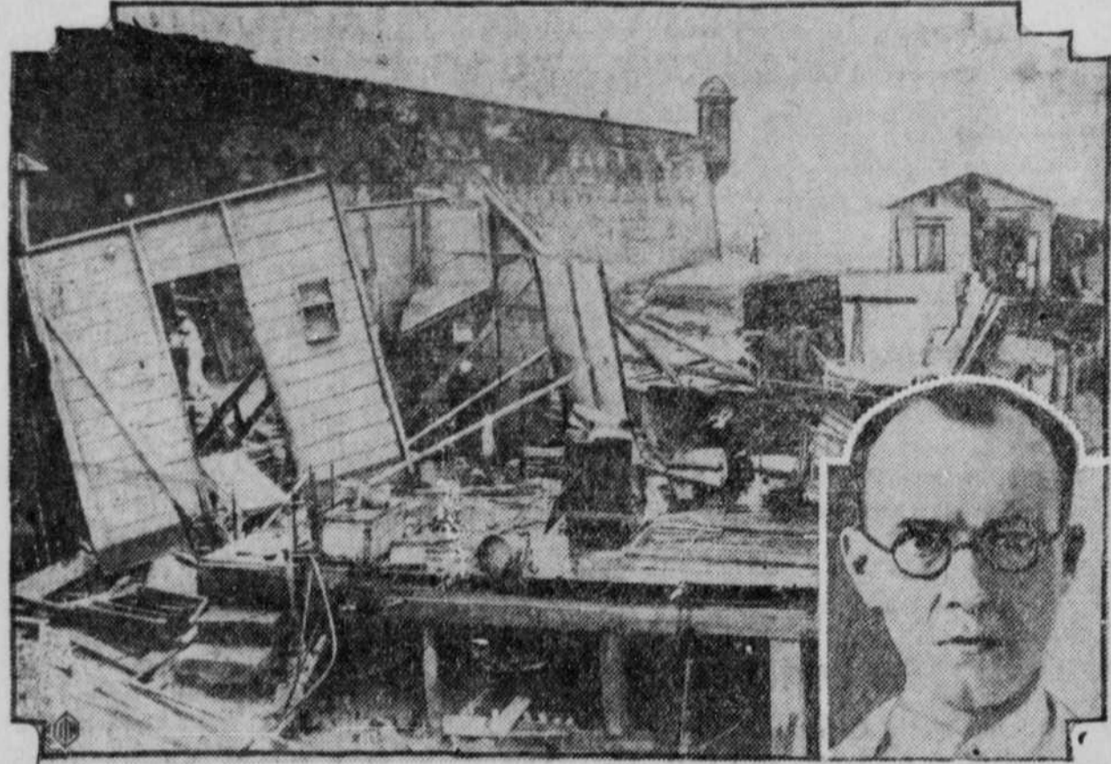
A scene on the San Juan, Puerto Rico, waterfront following the hurricane of 1928 in which hundreds died and thousands of dollars worth of damage was done to property. In the background is the historic Morro Castle. Similar scenes are again the rule on the island, following the disastrous 120-mile-an-hour gale that spread death and destruction. Besides the list of many dead, millions of dollars worth of crops and property have been totally ruined. Governor General James R. Beverley (inset) is head of the emergency committee that is aiding the injured and homeless. Relief is being rushed by every available means.