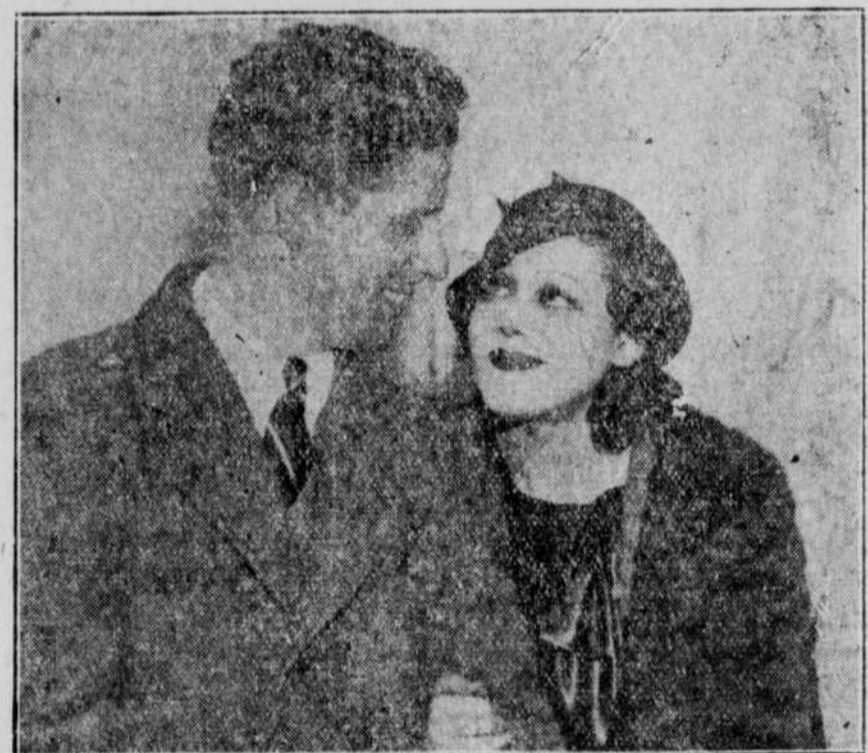
Rudy Vallee and his wife were reunited when Mrs. Vallee joined the crooner in Cleveland, putting an end to all talk of a possible divorce. Their smiles indicate they have forgotten Reno entirely.