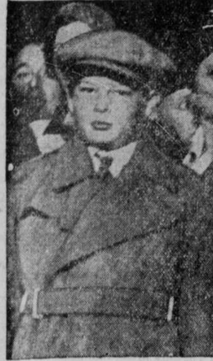
Prince Michael, son of King Carol of Roumania, is pictured at the railroad station in Paris en route to London, which he is visiting for the first time with his mother. The royal youngster, who was once a king, is growing rapidly and is the image of his father.