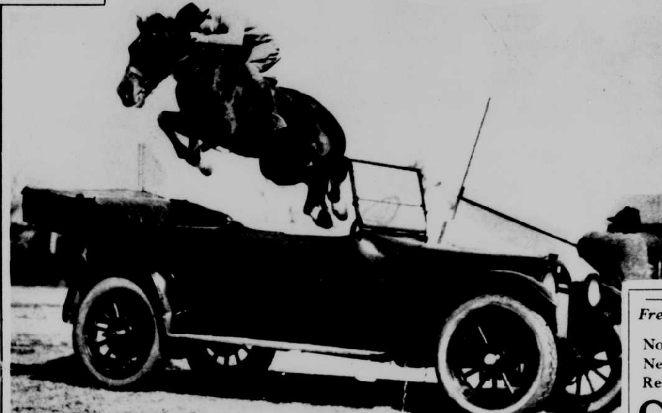
SOMETHING NEW IN HURDLES. Tipperary, a wonder horse, owned and ridden by Jack Presage, of Calgary, Canada, goes over the top of a standard Buick touring car—from a picture made recently on the grounds of the new and fashionable Bon Air Vanderbilt Hotel at Augusta, Ga. Tipperary in making this record jump cleared a distance of twenty-two feet in length and six and a half feet in height. Loide Wood