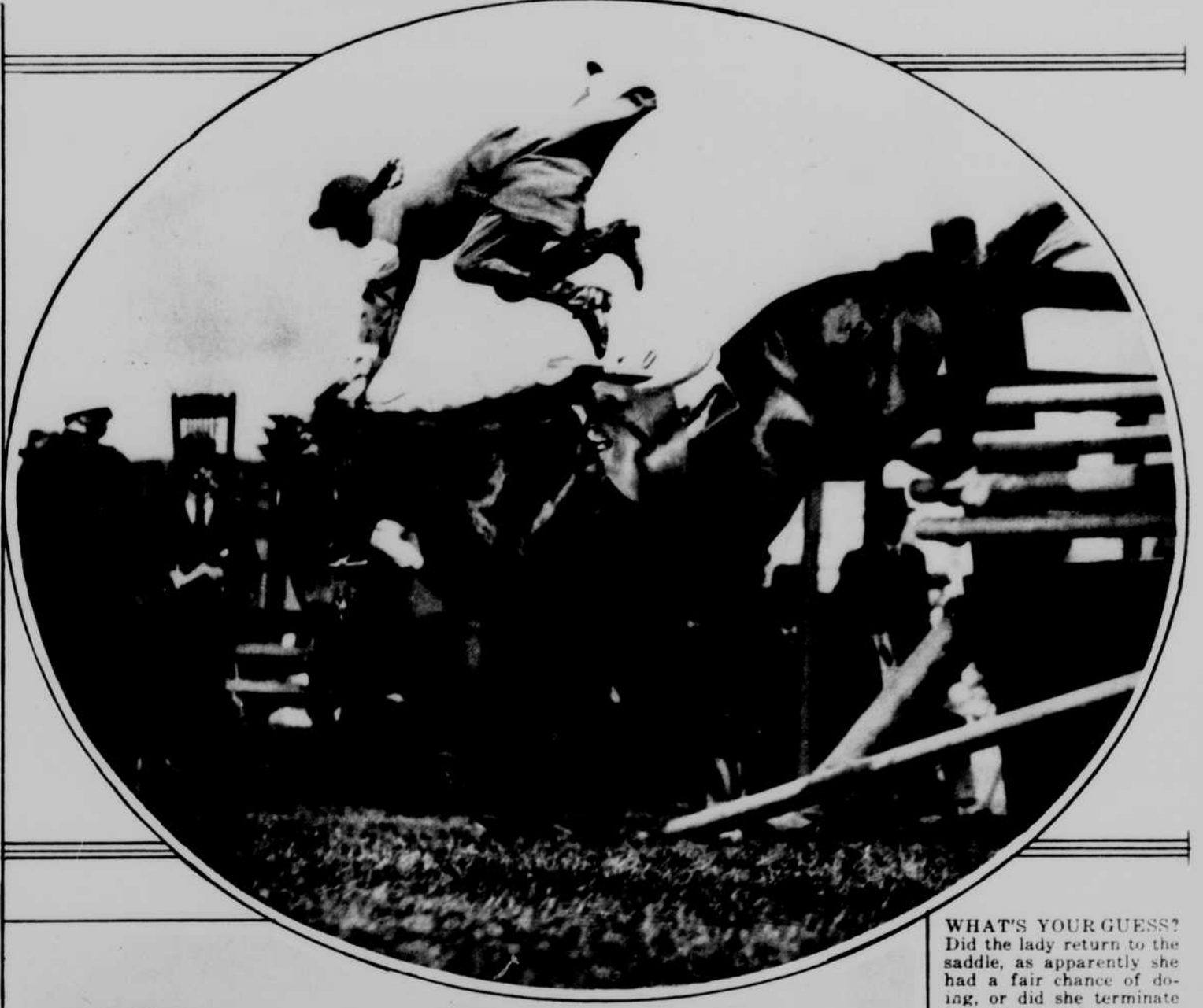
WHAT'S YOUR GUESS? Did the lady return to the saddle, as apparently she had a fair chance of doing, or did she terminate her unexpected flight on the turf? The correspondent who sent in this striking action snap, taken at the Royal Agricultural Society's recent show at Sydney, Australia, neglected to state.