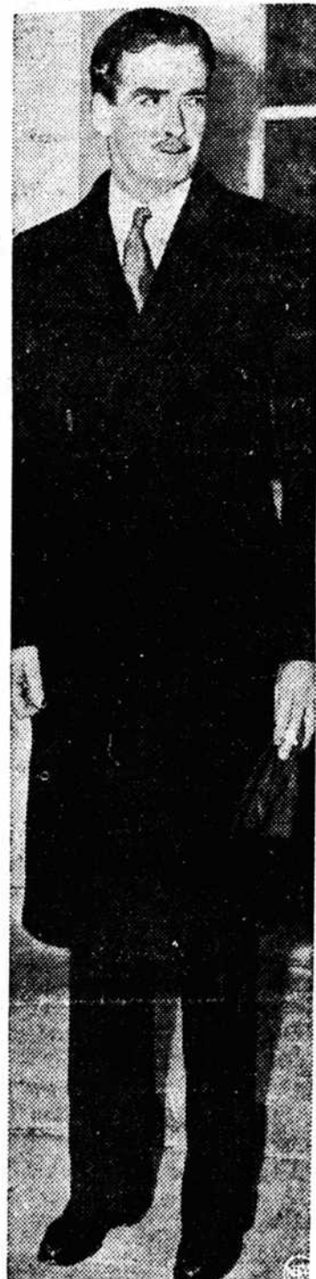
Tall, dark and handsome Anthony Eden after talking with the President in Washington. This picture shows why capital feminine contingent set up great clamor for visiting Britisher.

Ten states border on the Mississippi river.