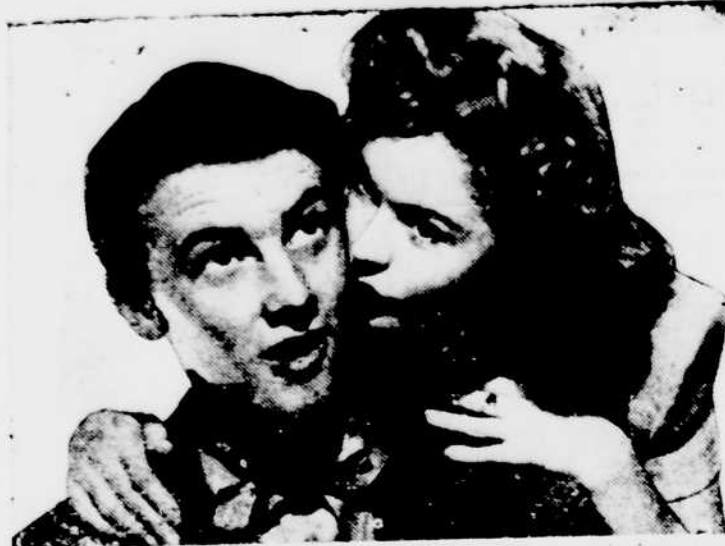
Shirley Temple and Jerome Courtland in the scene from Columbia's "Kiss and Tell"

Did you know...? Turn to Page Four for the latest answers.