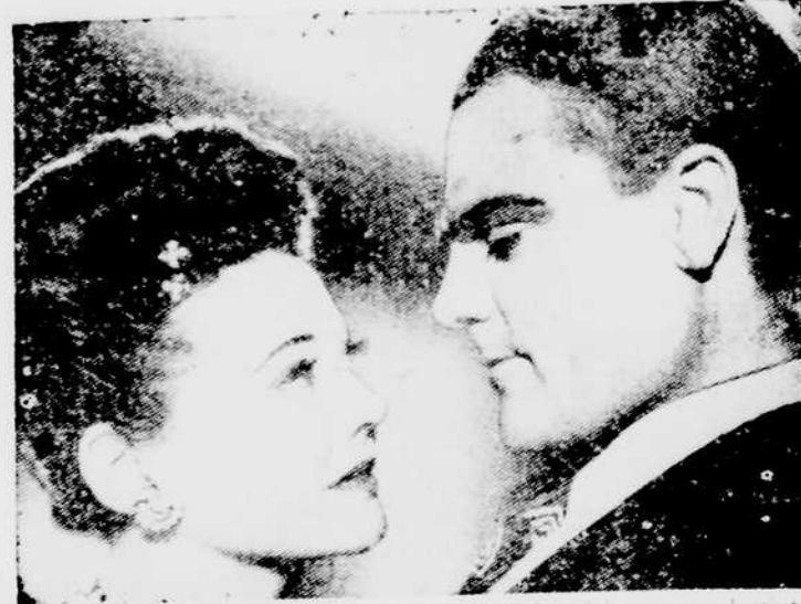
James Cagney as a hard-hitting reporter and Sylvia Sydney as a seductive Oriental beauty, match wits in the exciting "Blood On The Sun"