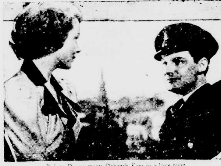
Robert Donat meets Deborah Kerr in a love tryst in "Vacation From Marriage"