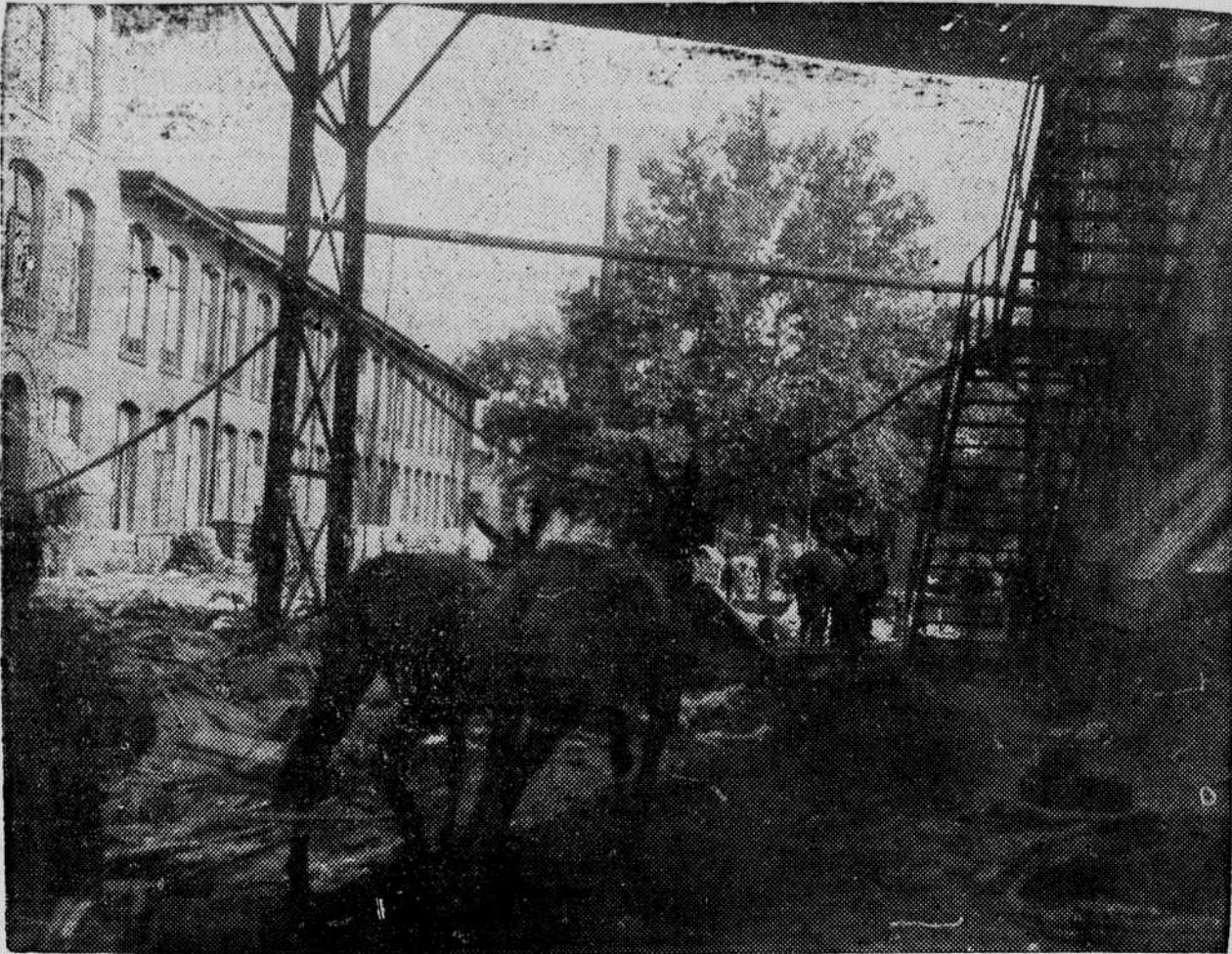
Above photo shows the grading work going on between the Roanoke Mills Company plant No. 1 buildings as hundreds of employees worked day and night to get the mill running again. Parts of the mill started up this week. More is expected to start soon, with the entire mill getting underway in a very short time.