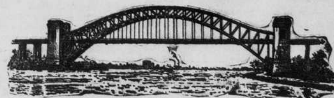
HELL GATE BRIDGE The connecting link in all-rail service between the Middle Atlantic States and New England and Canada

This will constitute the only direct all-rail through service to and from the Metropolis of Canada, making the Summer Resorts of the Province of Quebec more accessible, and bringing into still closer relationship the people of the two great American Countries