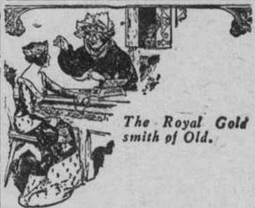
The Royal Goldsmith of Old.

Bandits cease their looting and the warriors their fighting when it rains in China, insuring peace to citizens.