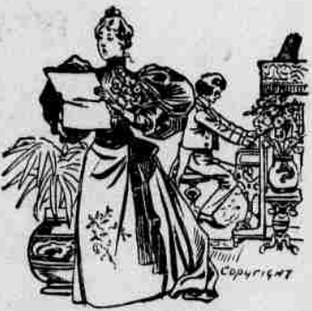
W. H. COEBEL, Catron Block - Santa Fe.

Cultivating the voice without a tuneful accompaniment is impossible.