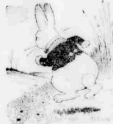
So Peter Kept on Going, Lipperty Lapperty-Lap.

So Peter had never started off from the Old Orchard, where he had been when the flying machine had come down on the Green Meadows.