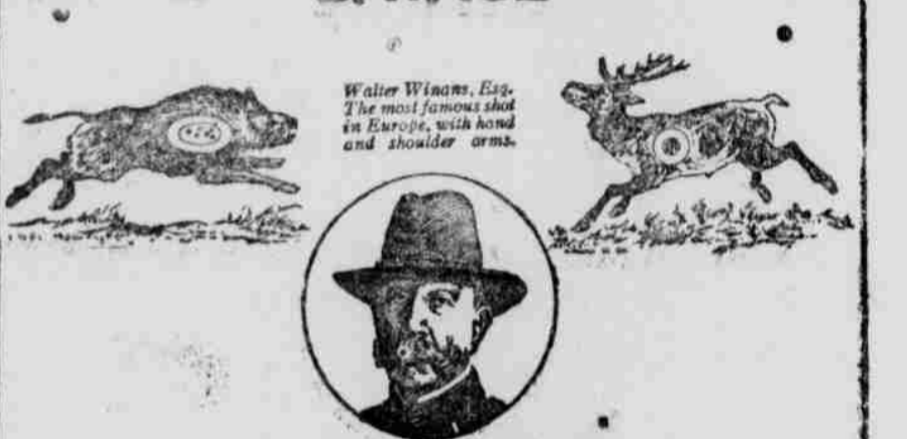
Walter Winans, Esq. The most famous shot in Europe, with hand and shoulder arms.