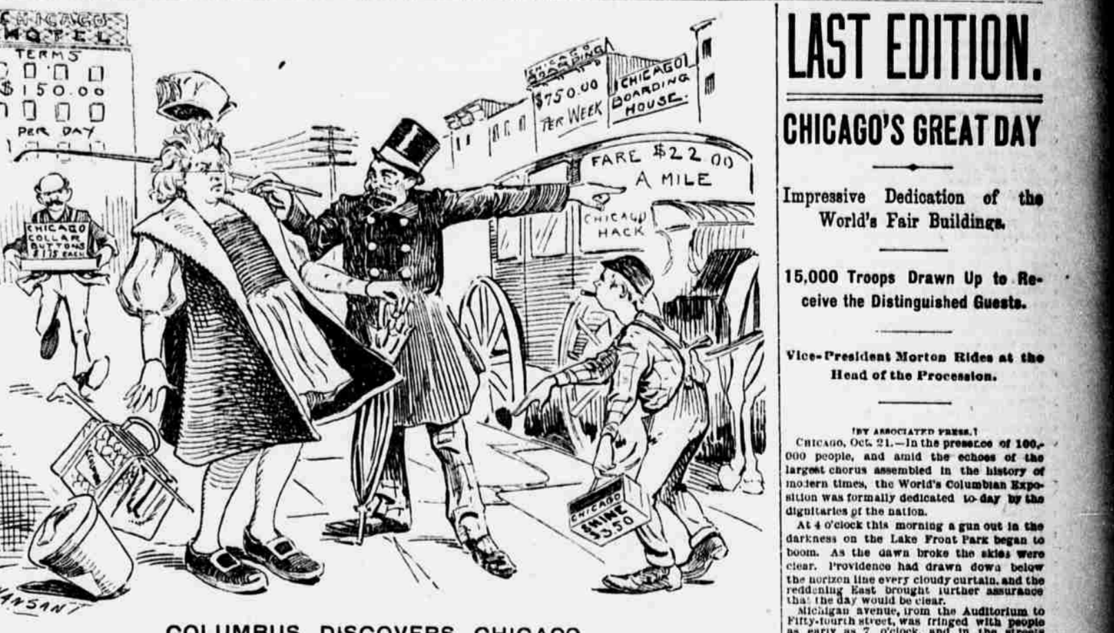
COLUMBUS DISCOVERS CHICAGO.

STANFORD WILL NOT RESIGN. Cañal's Senator Wants to Push His Lead-Loss Bill Through. STANFORD, Oct. 21.—Senator Stanford