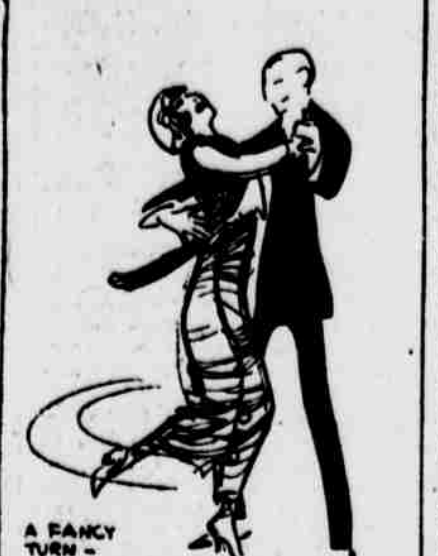
A FANCY TURN - SWINGING THE GIRL OFF HER FEET

"It is Really a Five-Step," Explains Vernon Castle, the Inventor. "The Count is One-Two-Three, One-Two. A Long Step, Like a Waltz Step, is Followed by Two Short Ones, Such as are Used in Dancing the Two-Step.