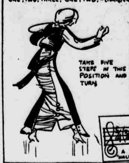
TAKE FIVE STEPS IN THIS POSITION AND TURN