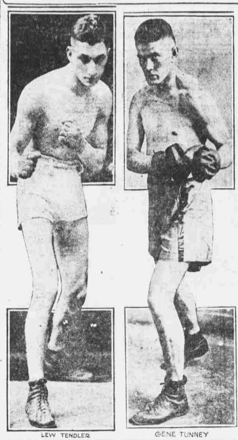
LEW TENDLER and GENE TUNNEY.