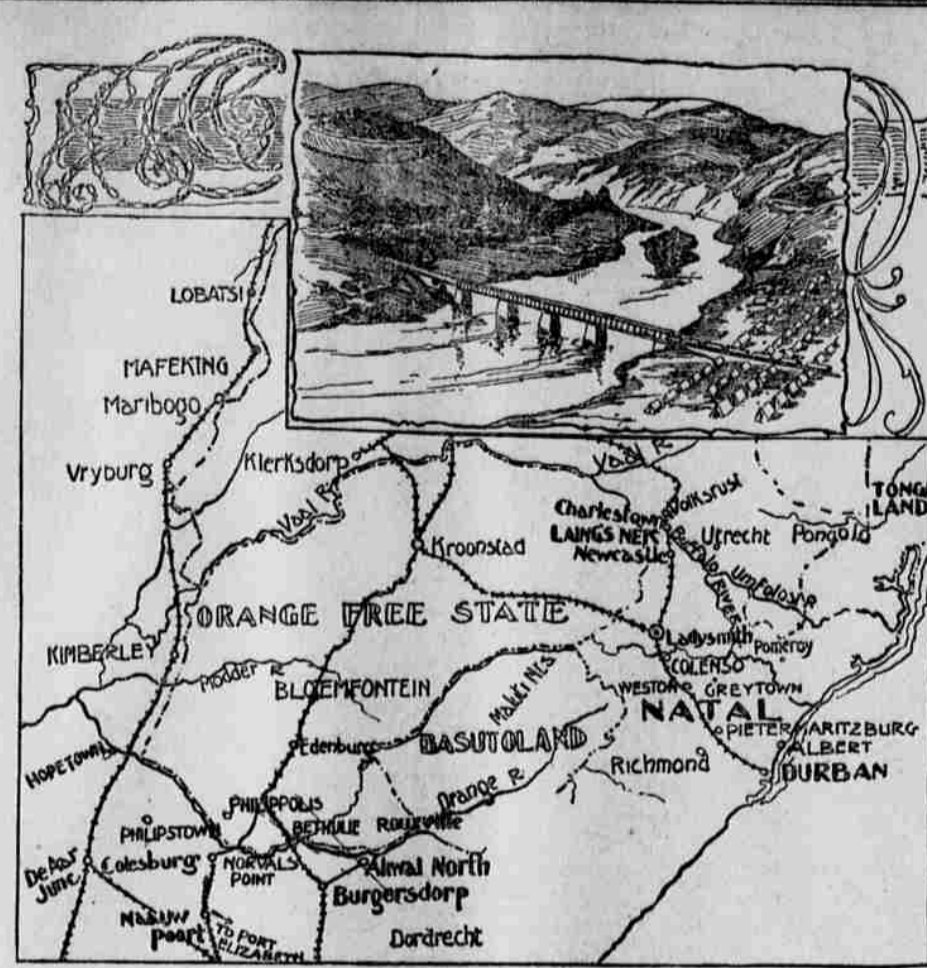
COLENSO BRIDGE AND WAR MAP, SOUTH AFRICA.

Durban is the chief port of Natal. It is 180 miles by rail from Ladysmith. At Colenso, 12 miles from Ladysmith, the railroad crosses the Tugela river, which is a broad, deep stream. The bridge at Colenso is a very important strategic point, coveted by both Boer and British leaders.