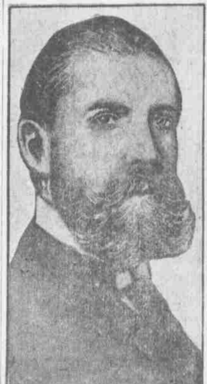
GOVERNOR C. E. HUGHES.