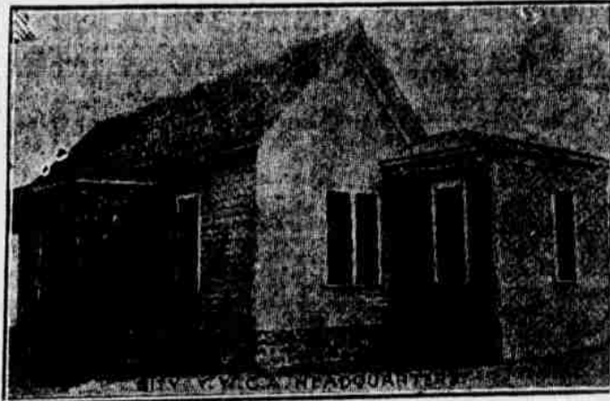
First home of Tulsa's Y. W. C. A.