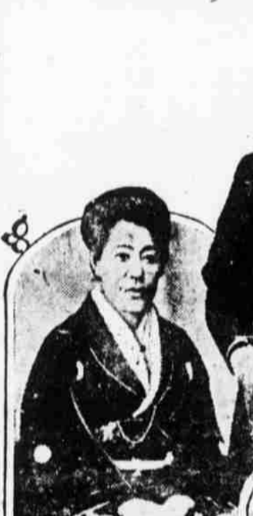
Kie Hara, new Japanese prime minister and his wife.

NEW YORK, Nov. 16.—The rise of Kie Hara to prominence in the Japanese nation has been by promotion for merit alone. He was born in Maruka province, northeastern part of Japan, of a family without political or aristocratic connections. He studied law at the now defunct law college of justice department, but left there before graduation to join the staff of the Tokyo Hochi and, as its special correspondent, accompanied Marquis Inouye to Korea in 1882. He subsequently became attached to the foreign office.