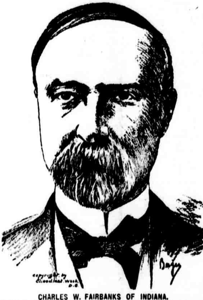
CHARLES W. FAIRBANKS OF INDIANA.